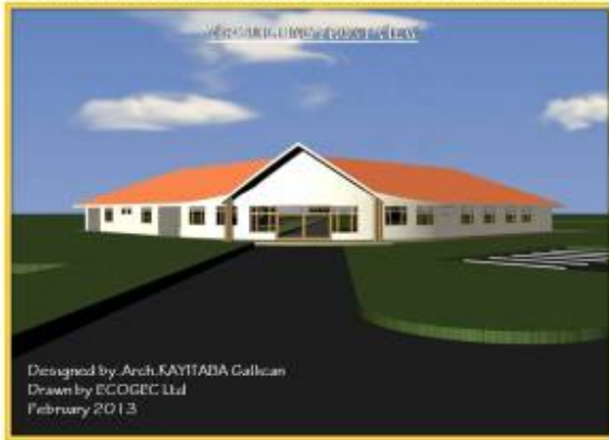
CONSTRUCTION OF PEACE CENTER AT MUHARI/WESTERN PROVINCE/RWANDA

consist of a reception hall, secretariat, an office, a living room, an oratory, a refectory, a kitchen, a store, 4 sleeping rooms with terraces and washrooms.